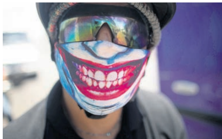
A man wears a mask featuring the smile of comic book character The Joker, amid the spread of the new coronavirus in Caracas, Venezuela, Monday, March 30, 2020.